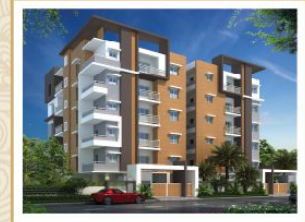
SAI'S SHRAVYA ENCLAVE