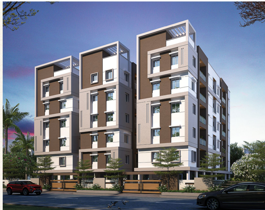
North East View

Where love resides, dreams come alive in this house